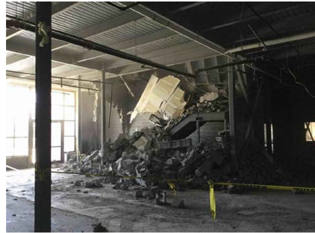
Area C – Front Stair Demo