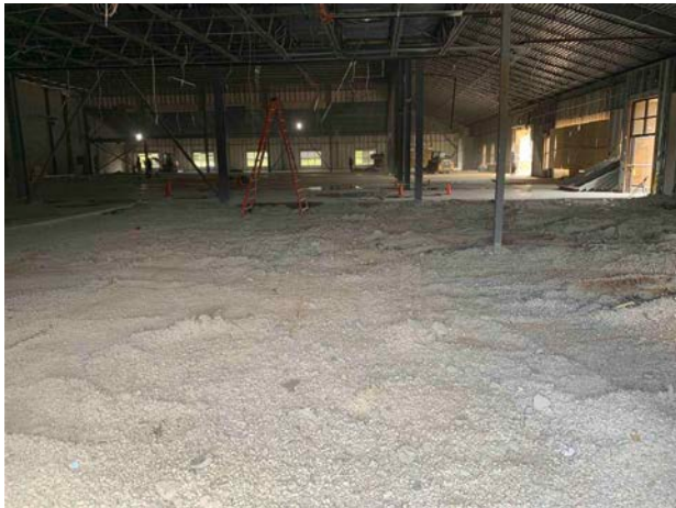
Area A - Flor Slab Demo