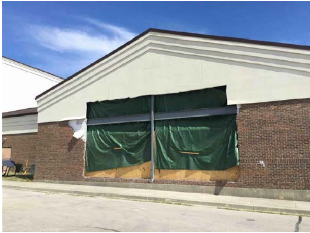
Area A - Exterior Demo (North)