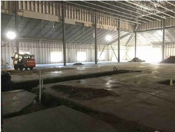
Area C – Slab Trenching