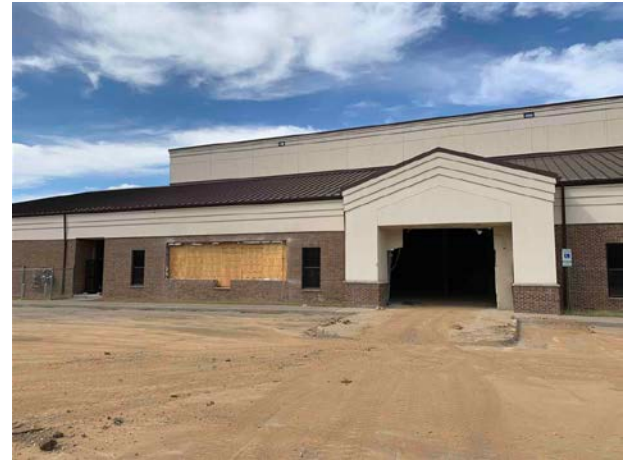
Area A - Exterior Demo (West)