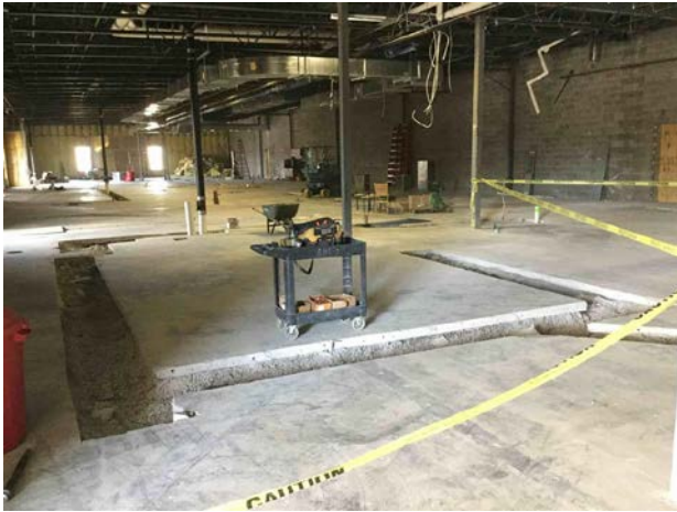
Area A – Slab Trenching