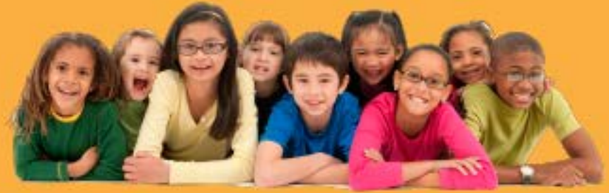
Cardinal Valley Back to School Bash August 3rd