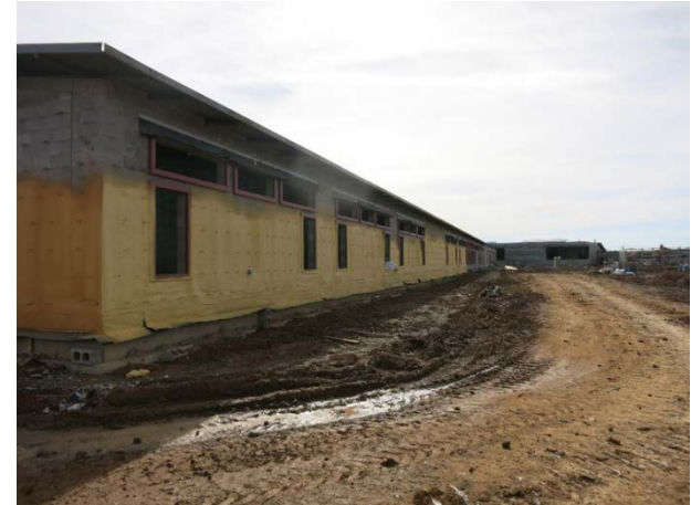
Sector D – West Side