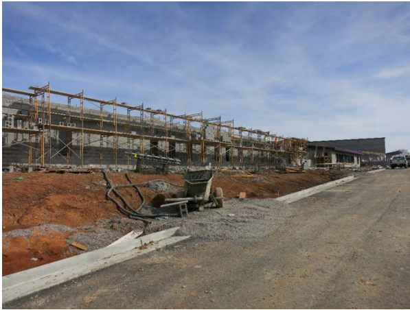
Sector A & B – Masonry