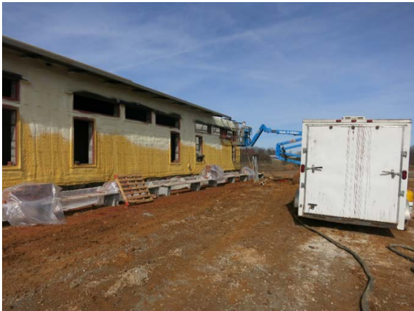
Sector D & E