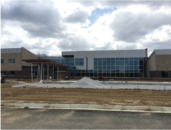
North Entry Steel