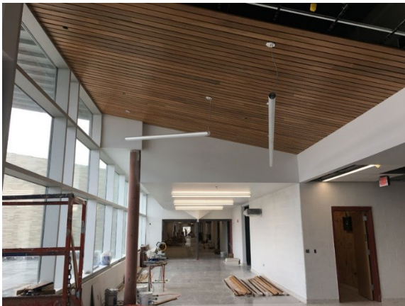
Wood Ceiling – Area E1