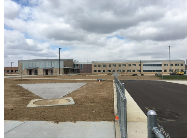
View from South