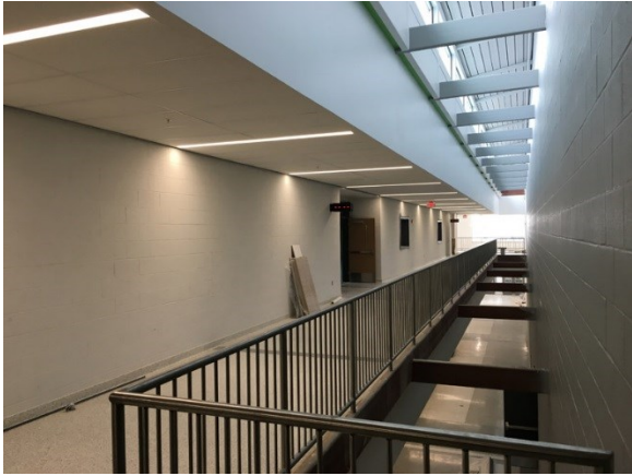
E Corridor at Main Gym