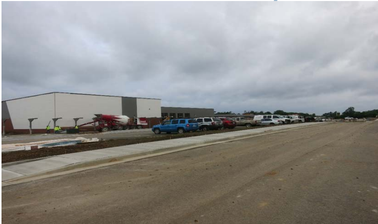
New Sidewalks -- Gym