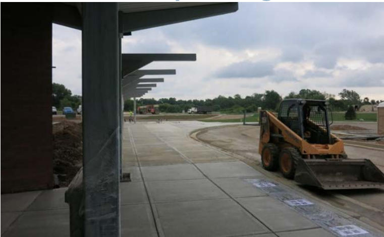
Front Entry Looking East