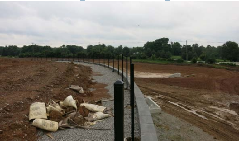
Retaining Wall Looking South