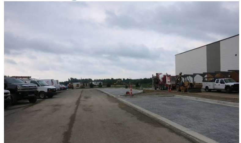
Parking Lot Paver Installation