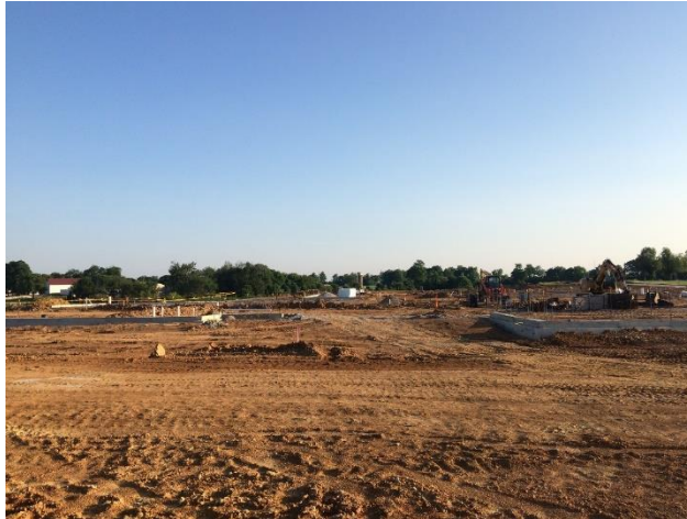
View Towards Front Door