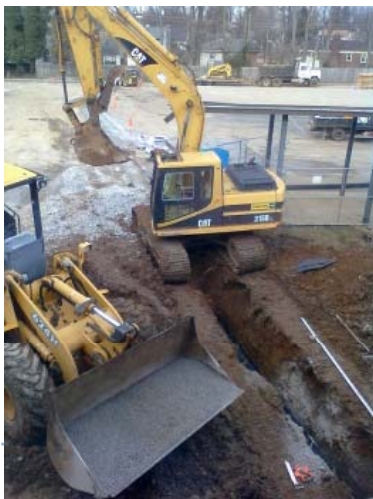
Admin Area Foundations