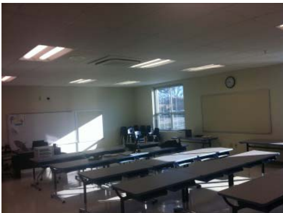
Typical New Classroom