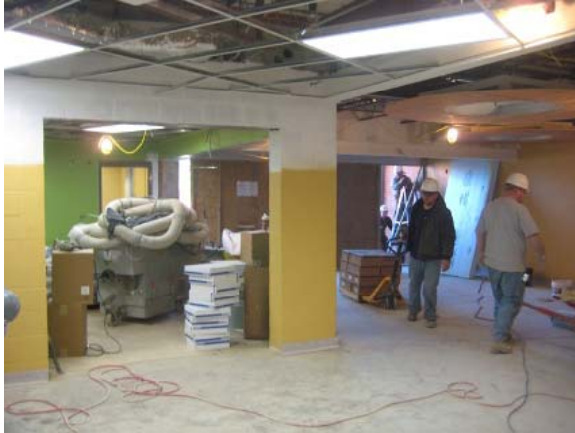
Admin. Reception & Main Entry