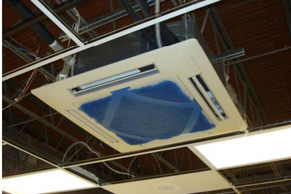
Ceiling Grid & HVAC Cassettes