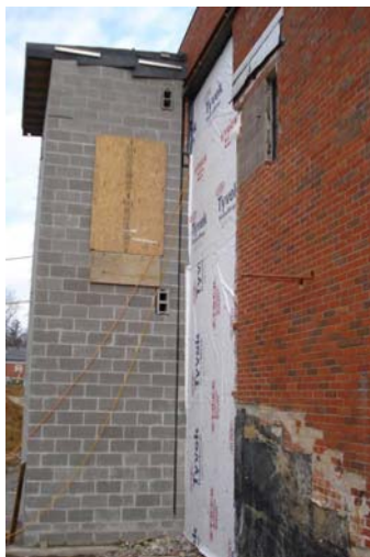
New CMU Chase