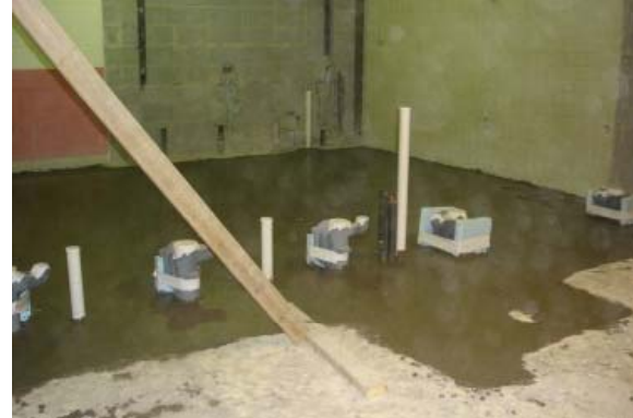
Replacement Slab in Restrooms