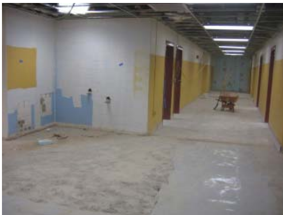
First Floor Corridor