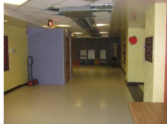
Temporary IDF Closet