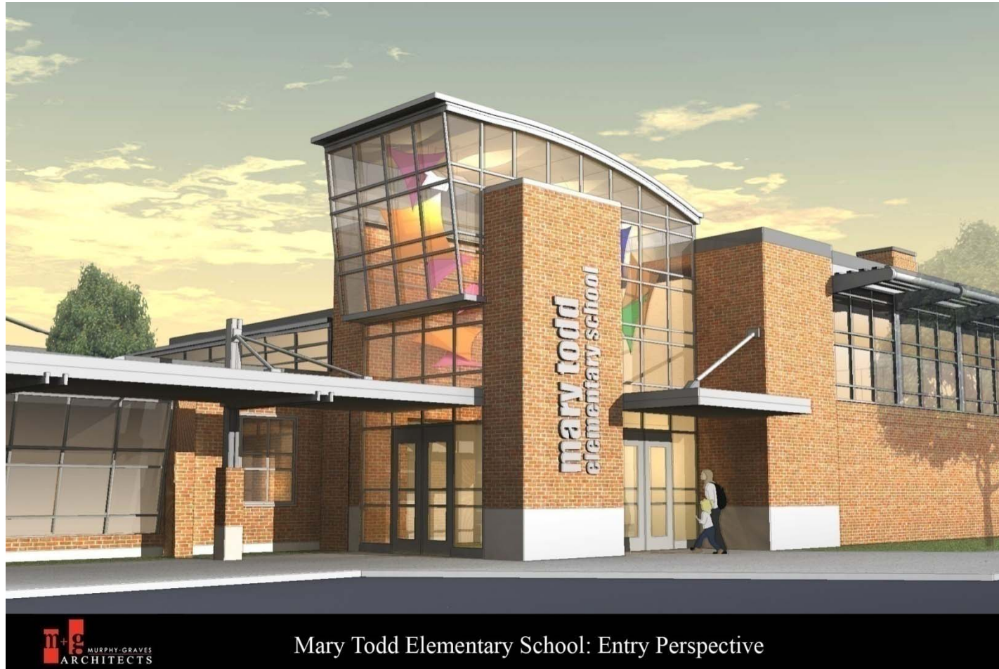
Mary Todd Elementary School: Entry Perspective