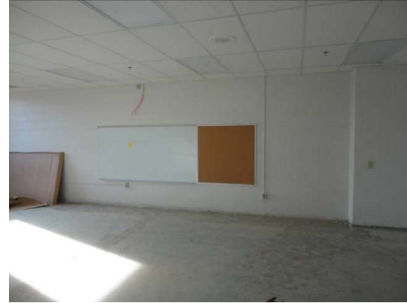
Marker & Tack Boards