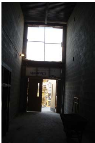
New Entry from Bus Drop Off