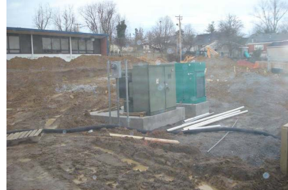
Transformer & Generator