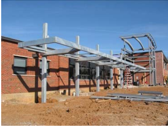
Exterior Canopy Framing