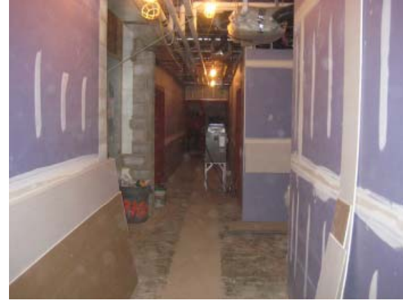
Lower Level Corridor