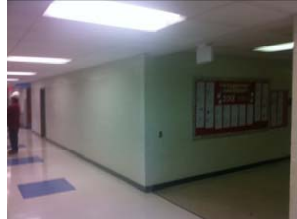
Lighting – New vs. Old Areas