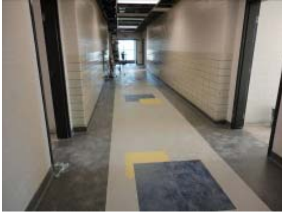
Terrazzo in Corridor