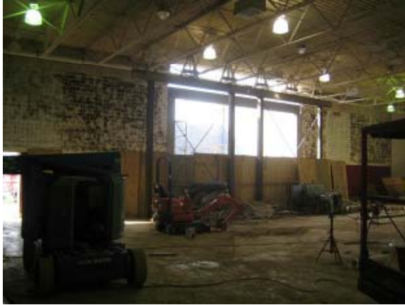
Gym Demo & New Stage Opening