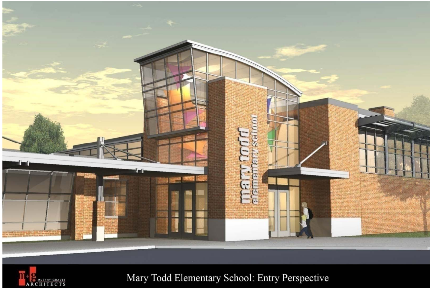
Mary Todd Elementary School: Entry Perspective