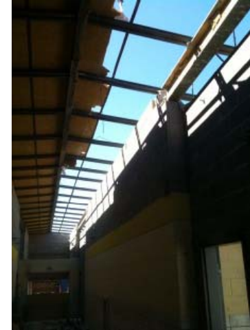
Removal of Existing Roof Deck