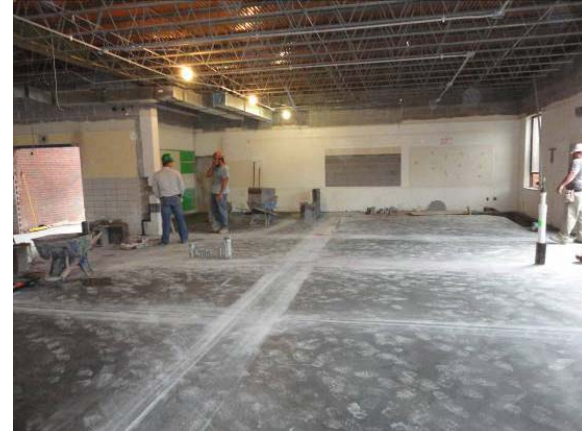
New Lower Level Slab