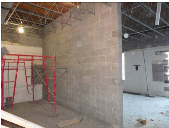
New Interior CMU Walls