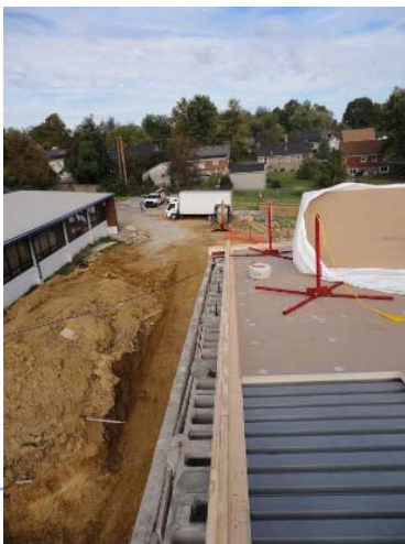
New Steel Decking & Roof