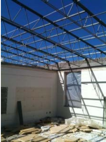
Removal of Existing Roof