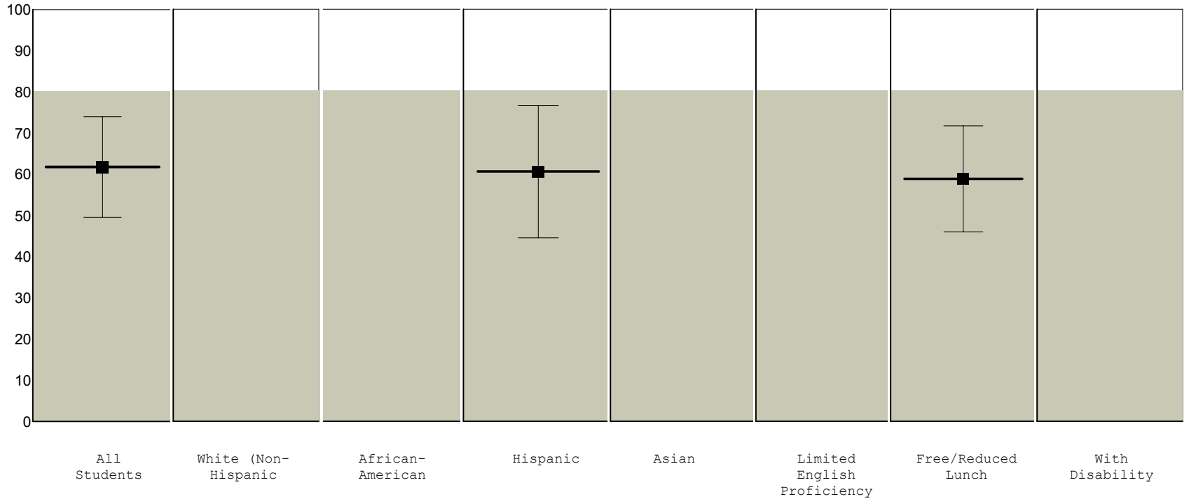
2011 Reading AMO

School: Russell Cave Elementary School District: Fayette County Code: 165090 Title I: Yes