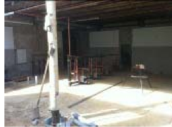
Interior Underground Plumbing