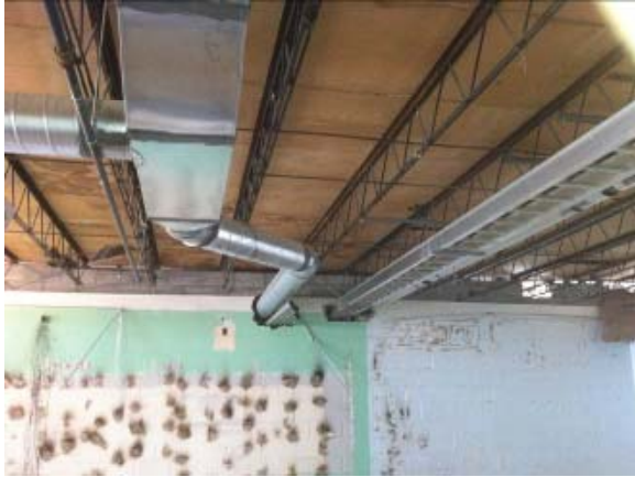
Duct Rough In