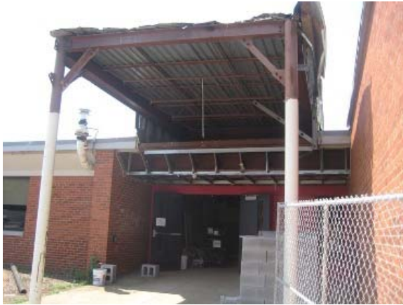
Demo -- Bus Entry Canopy