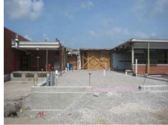
New Mechanical Room & Loading Dock