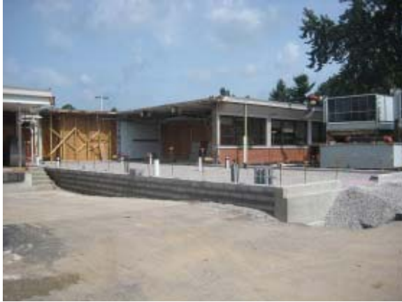
New Mechanical Room