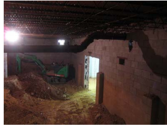
Crawl Space Excavation