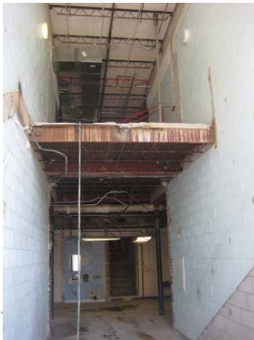
West Wall Demo for Elevator