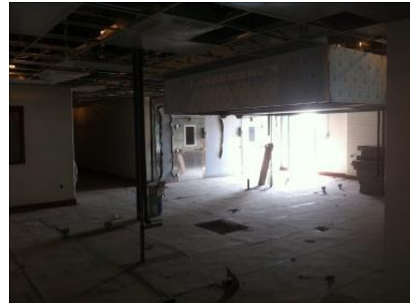
Installation of Kitchen Equipment