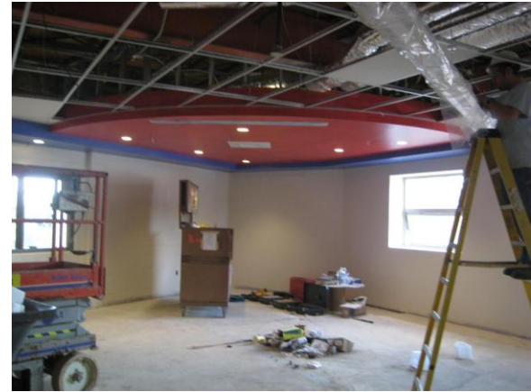
Media Ctr. – Reading Area