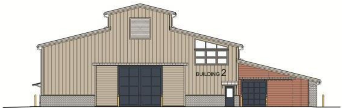
○ ARENA - WEST ELEVATION