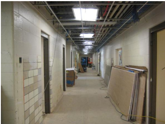
Area D -- Corridor