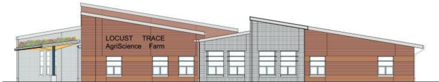
○ ACADEMIC CLASSROOM BUILDING - WEST ELEVATION