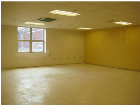
Area "C" Classroom