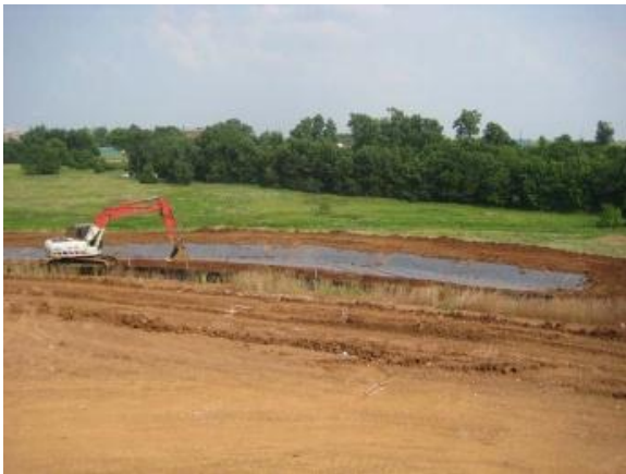
Constructed Wetlands – Liner Install