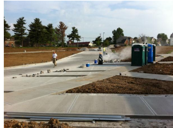
Permeable Pavers in Bus Loop