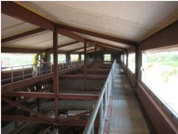
Arena Catwalk—Looking Down to Riding Area