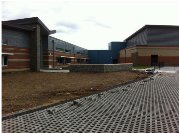
Fire Lane Pavers