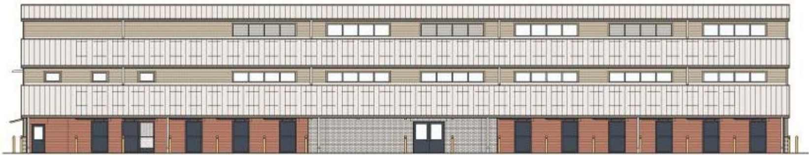
ARENA - SOUTH ELEVATION