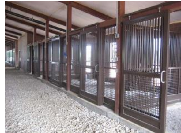
Arena – Horse Stalls