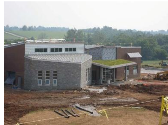
Academic Bldg.—Entry w/ Green Canopy