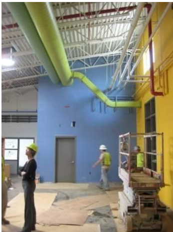
Academic Bldg.—Lab Painting