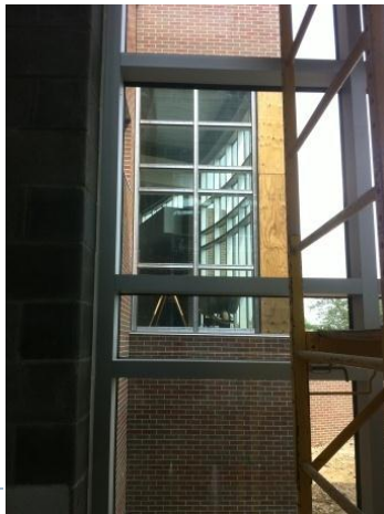
Storefront & Curtain Wall