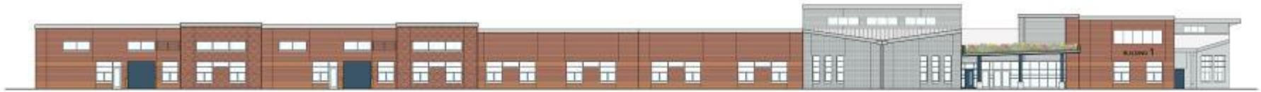
ACADEMIC CLASSROOM BUILDING - NORTH ELEVATION