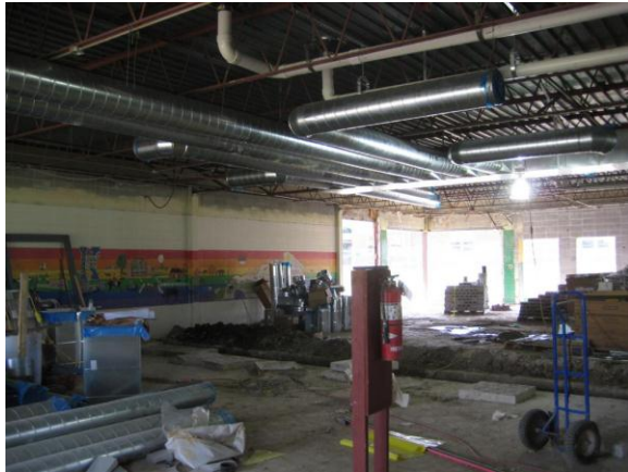
Café Mechanical Duct Install