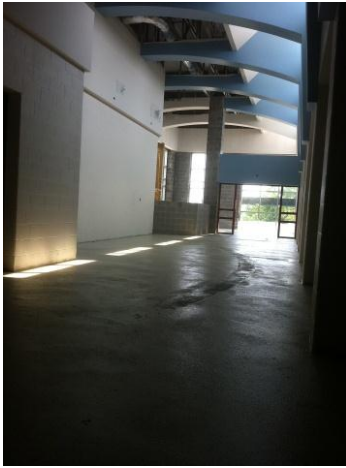
Primer & First Coat Paint