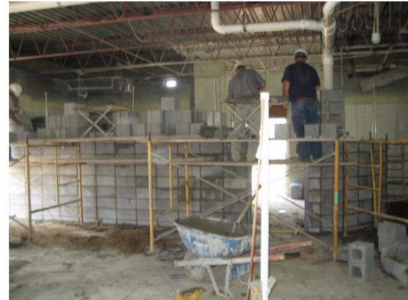
Kitchen CMU Walls