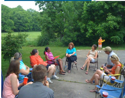
PTA Leadership Picnic—great minds!

Thank you for the service of great PTA officers over this past year and those of you who have stepped up for the coming year! It will be a great new time to make a difference in the lives of all children in your school and in this district.