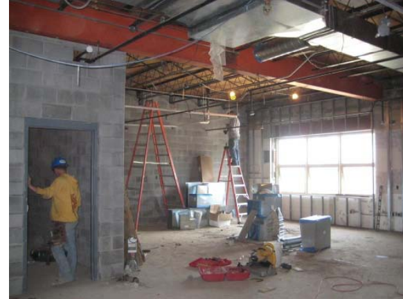
New Art Room