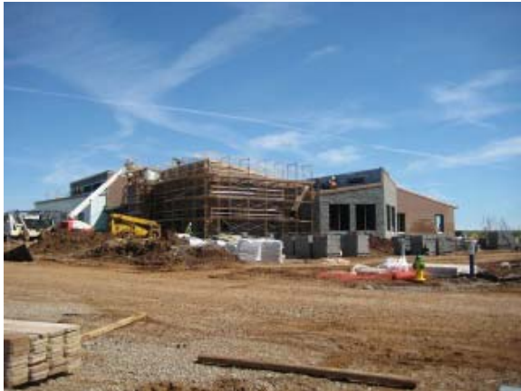
Academic Bldg.—West Elevation