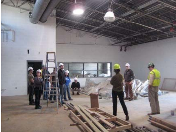
Academic Bldg.—Looking to Classrooms