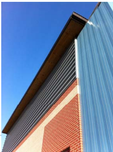
Gym Wall Panels