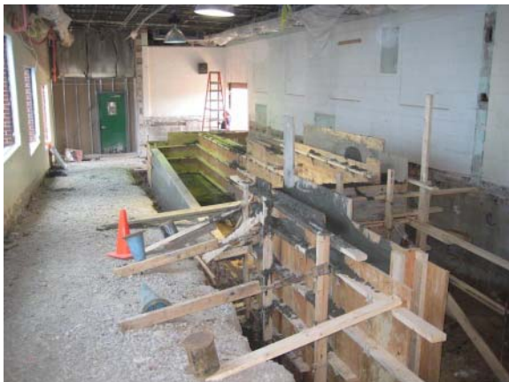
Corridor Handicap Ramp