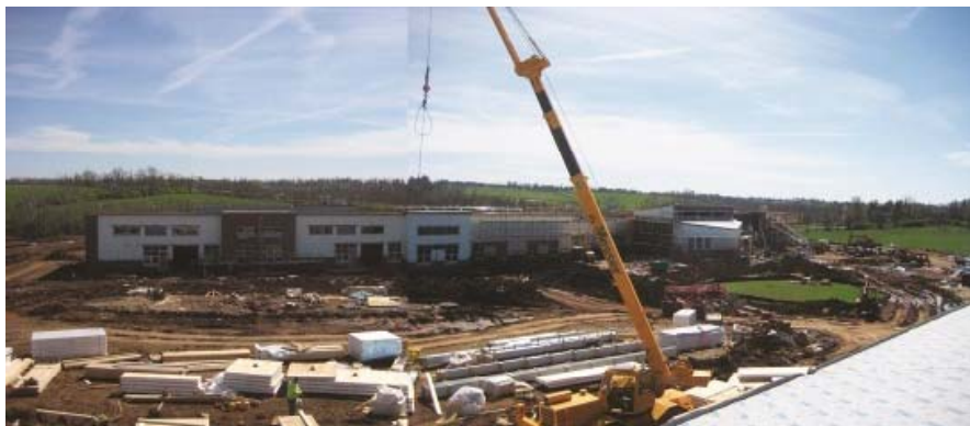
Academic Bldg.—North Elevation