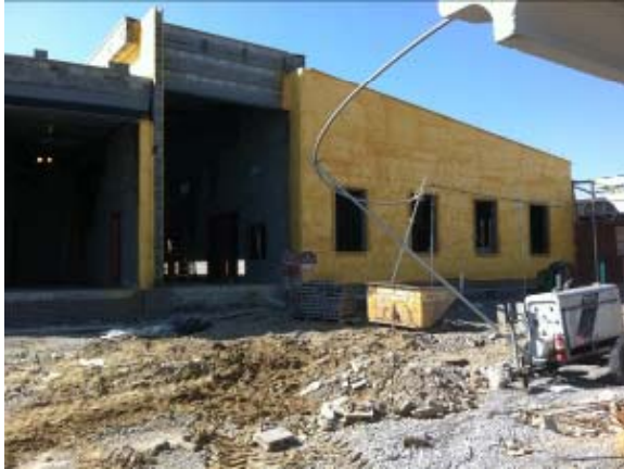
Spray Foam Insulation