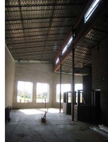
Academic Bldg.—Media Ctr.