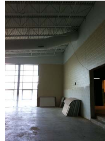
Café Ceiling Painted