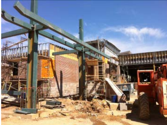
Structural Steel on Canopies