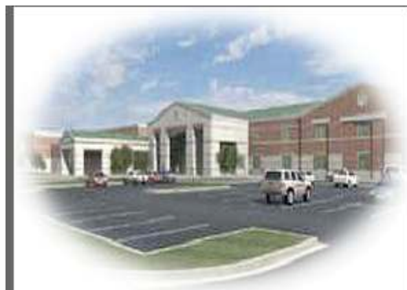
Bryan Station High School

How Our School Ensures Educational Equity: An equity plan has been established at Bryan Station High School that addresses the needs of our diverse population, ensures that all students have access to a challenging and relevant curriculum, and encourages achievement at the highest level. Our plan is also designed to close all achievement gaps by 50% between white and African-American students; students with disabilities and students without disabilities; and free/reduced lunch student and non-free and reduced lunch students. To reach our equity goals we will increase student achievement through 1) curriculum and instruction that sets high expectations for all students; 2) differentiated instruction that addresses the learning needs of all students; 3) increasing the number of students in advanced placement courses. Educational equity is and will continue to be a priority at Bryan Station High School.