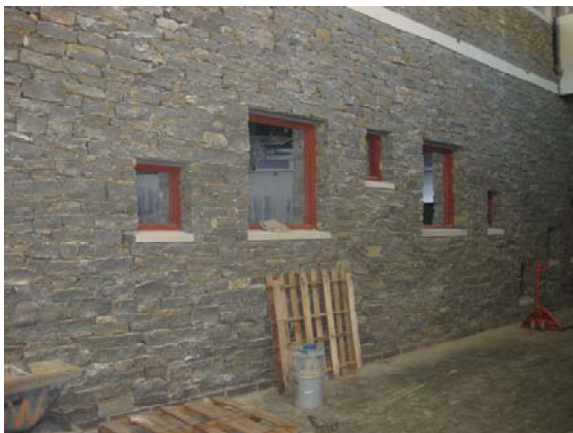
Interior Precast Sills Installed