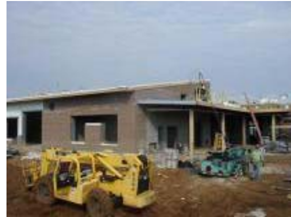
Academic Bldg. – Brick on Southeast End