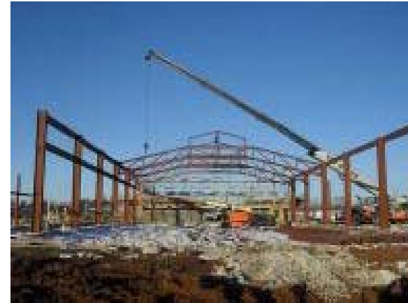
Arena – Setting of Roof Steel