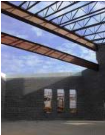
Academic Bldg. – Steel for Clerestory