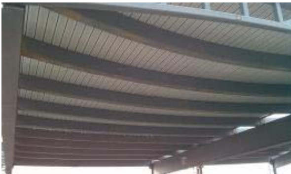
Media Ctr. Acoustical Roof Deck