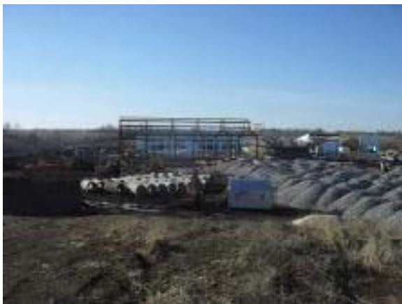
Arena – Roof Framing