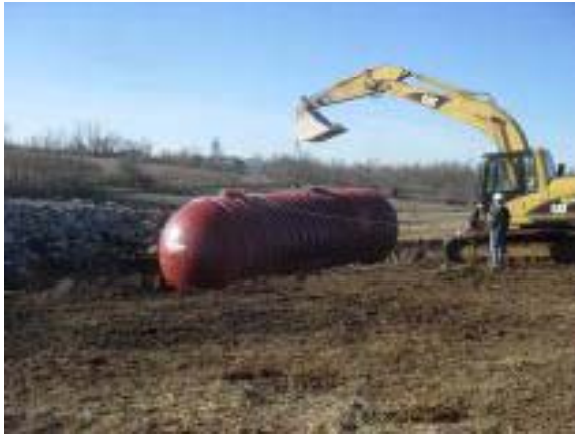
Rainwater Harvesting Tank