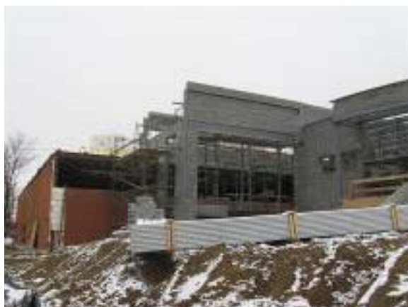
CMU Walls at Gym