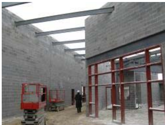
New Main Corridor