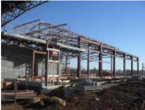
Arena – Along South Face