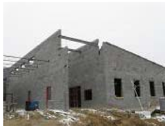
CMU at New Entrance