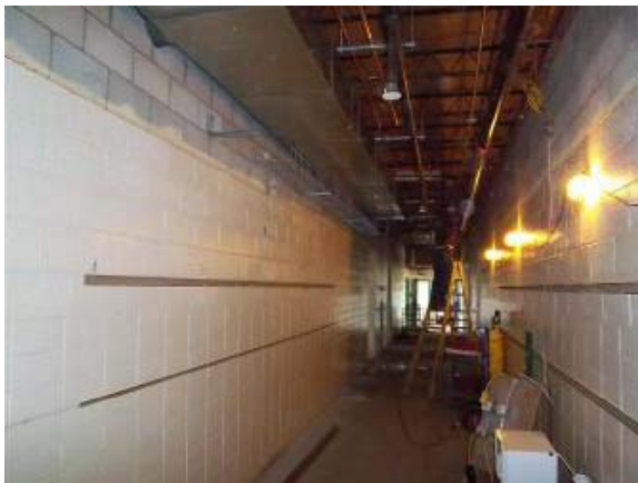
Demo of Existing Corridor