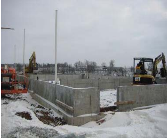
Academic Bldg. – Greenhouse Foundation