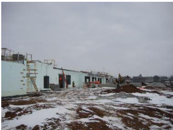
Academic Bldg. – South Elevation