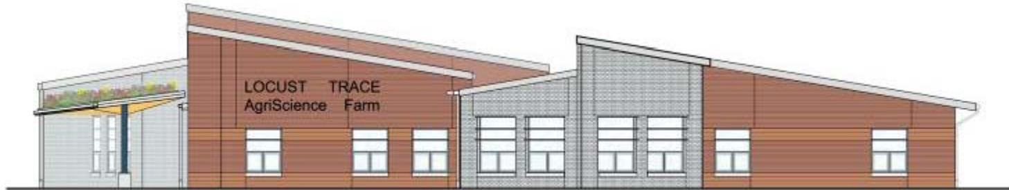
○ ACADEMIC CLASSROOM BUILDING - WEST ELEVATION