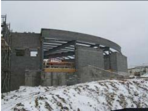
CMU Bearing Walls