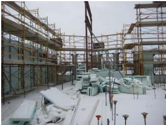
Academic Bldg. – Media Ctr. Looking West