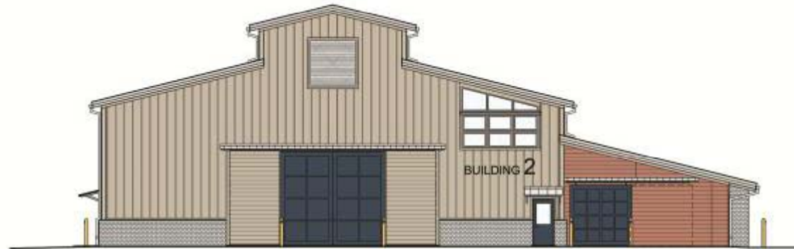
○ ARENA - WEST ELEVATION