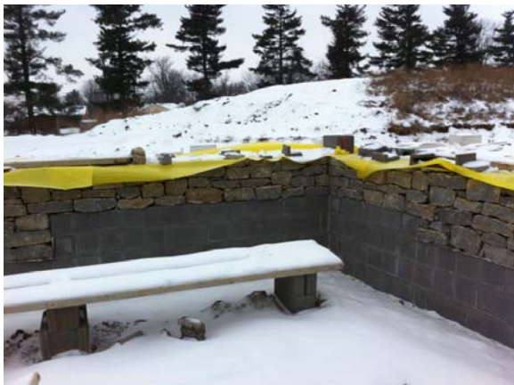
Exterior Seat Wall Installation