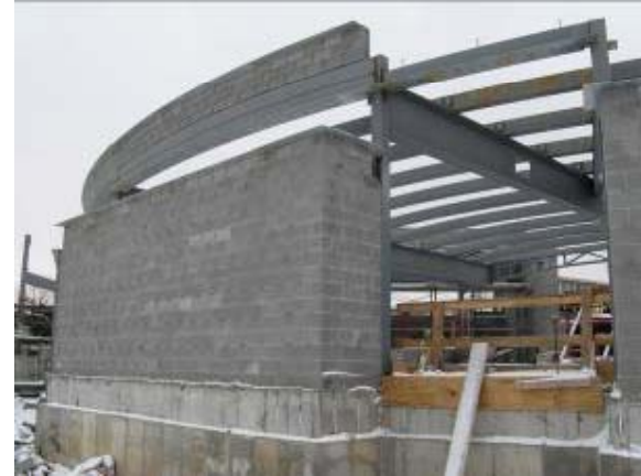
Brick Veneer to Begin