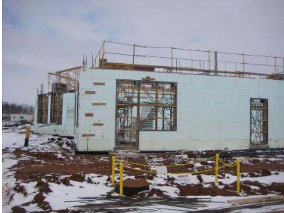
Academic Bldg. – Vet Clinic Entrance