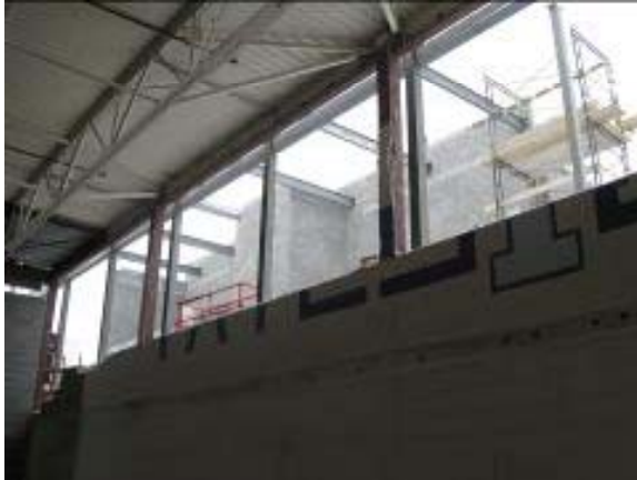
Structural Steel @ Addition