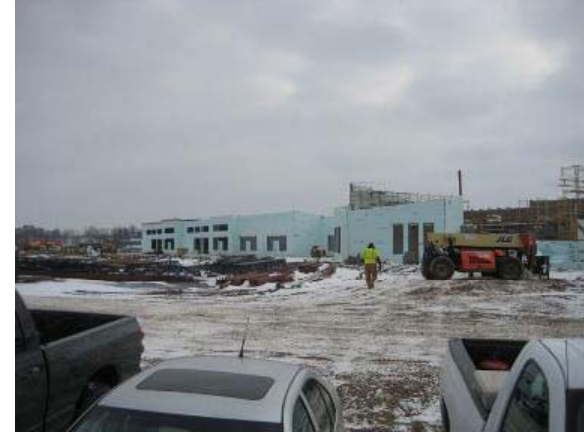
Academic Bldg. – North Elevation