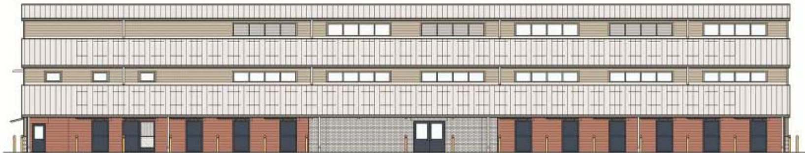
ARENA - SOUTH ELEVATION