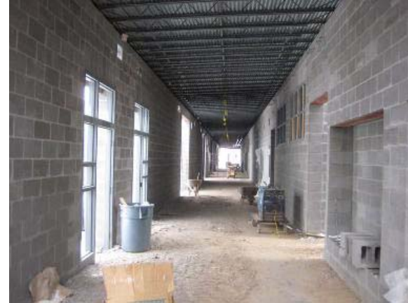
Academic Bldg. – Main Corridor