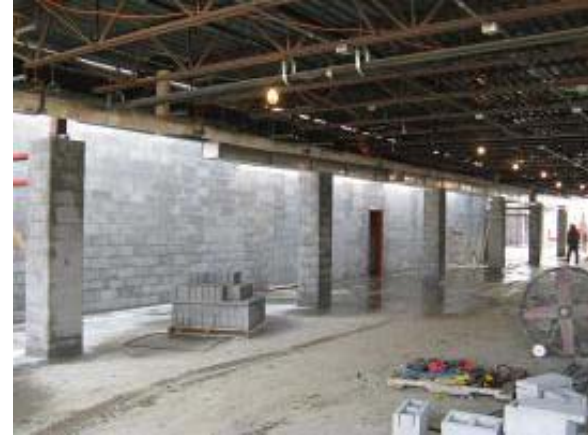
CMU Veneer Column Wrap -- Cafe