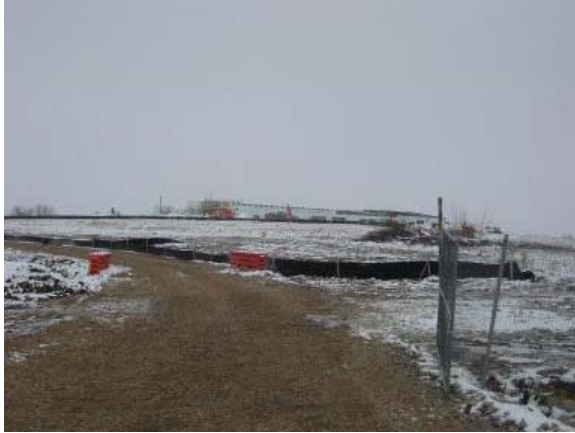
Academic Bldg. from Leestown Rd.