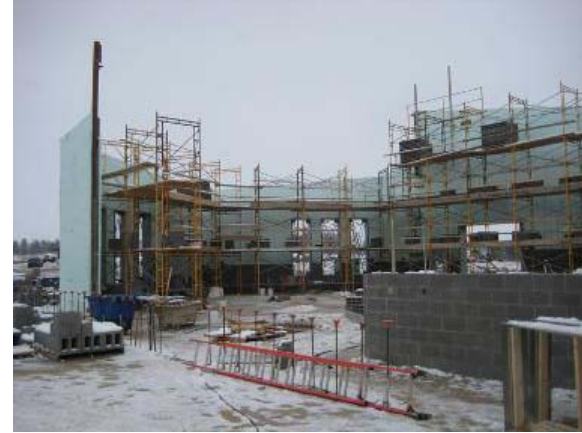
Academic Bldg. – Assembly Room