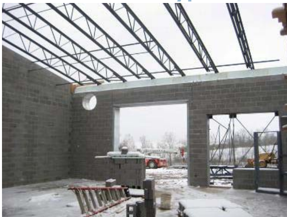
Aerial View – Typical Lab