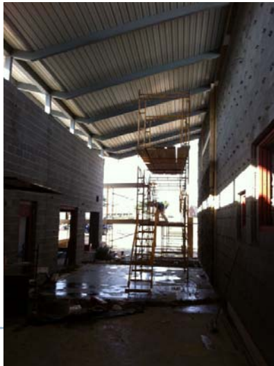
Acoustic Decking in Main Entry