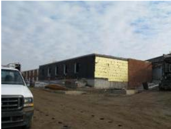
Future Band Room