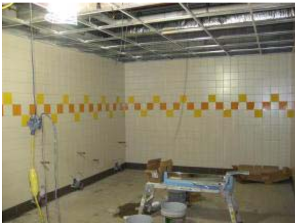
Tile in Girls' Restroom