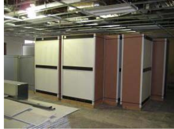
Delivery of Casework/Cabinets