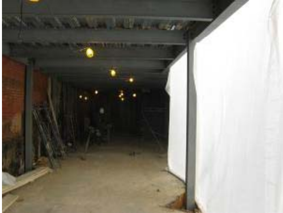
Lower Level Ceiling Structure