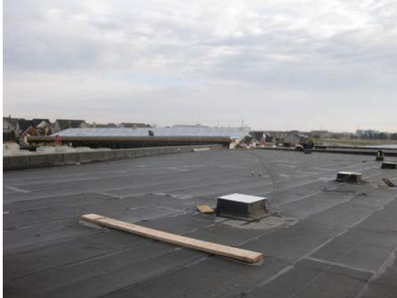
Base Layer of Built Up Roof