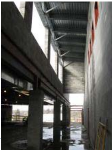
Metal Roof Deck