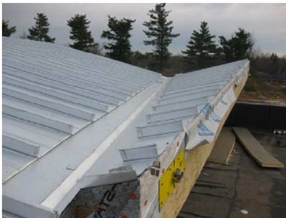
Metal Roof – South Corridor