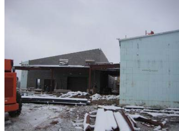
Academic Bldg. East End Entry