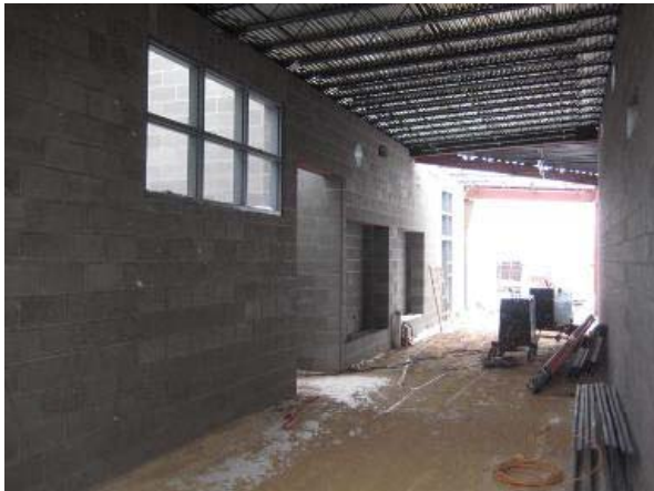
Academic Bldg. Main Corridor