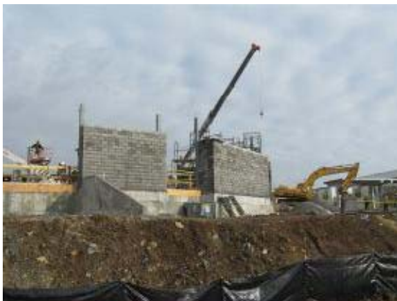
Media Center Steel & CMU