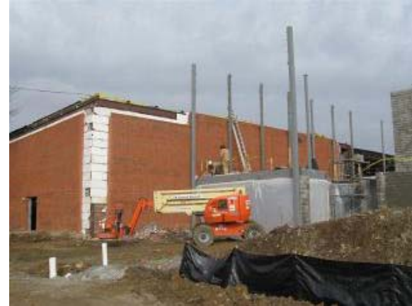
Gym Lobby Steel