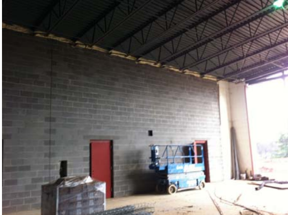
Spray Foam Insulation at Tops of Walls