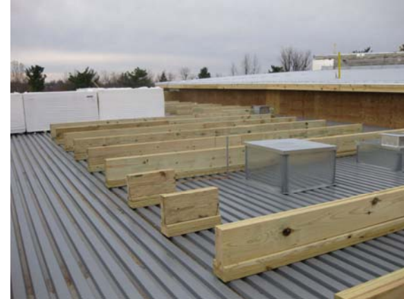
Roof Curbs for Solar Hot Water Panels