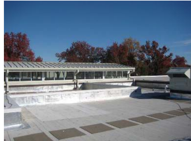
Media Ctr. Atrium Roof