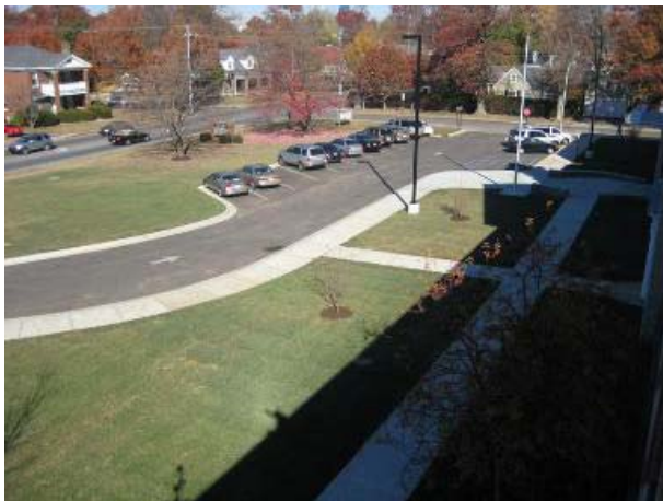
New Guest Parking Lot