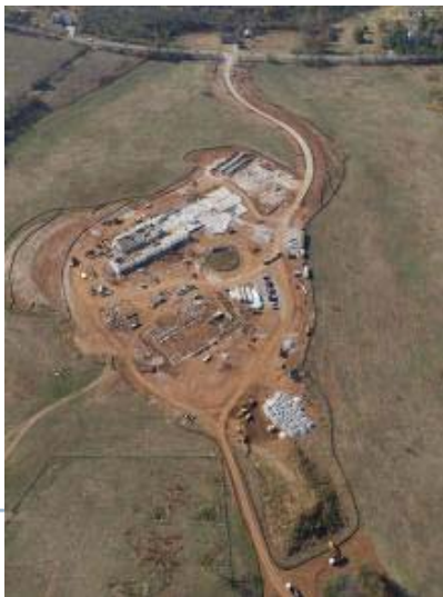
Aerial View – Main Entrance at Top