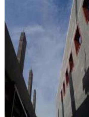
New Masonry in Cafe