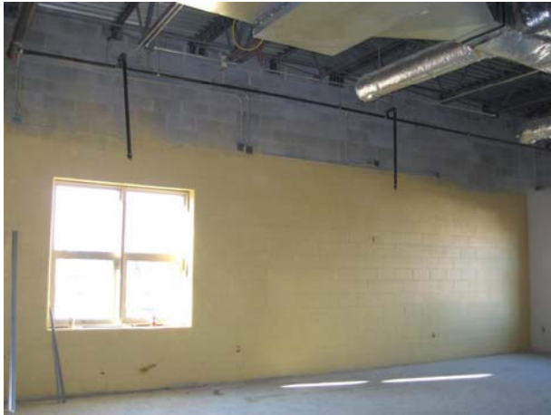
New Classroom – 1 st Coat Paint