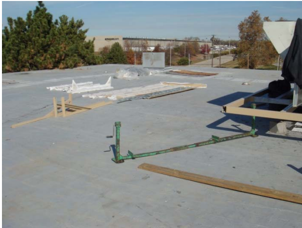
Gym Roof Work