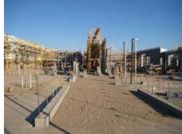
Academic Bldg. East Corridor