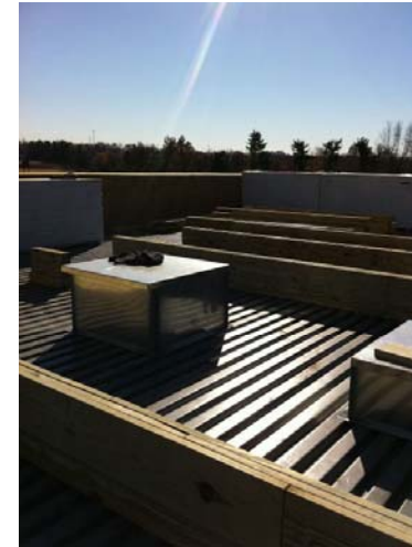
Roof Top Curbs -- Kitchen