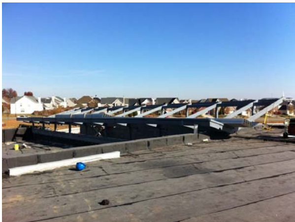
Main Entry Structural Steel