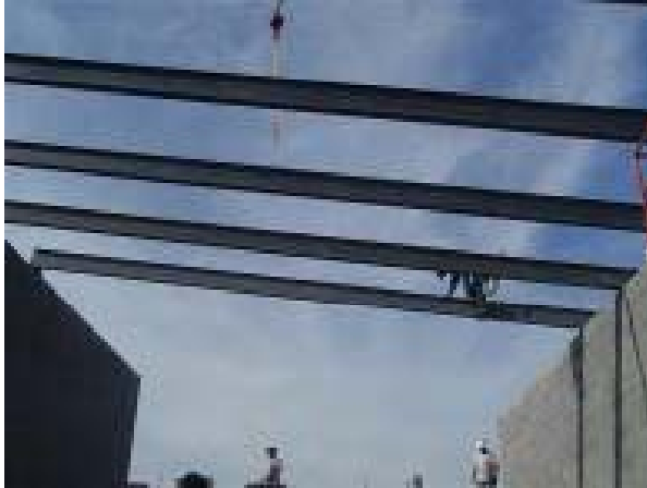
Structural Steel -- Courtyard