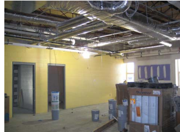
Installation of HVAC Ducts