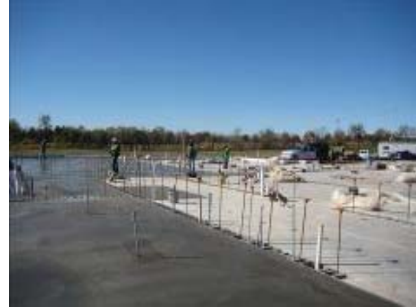
Academic Bldg. – Media Ctr. & Vet Clinic