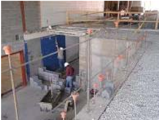
Structural Steel -- Gym