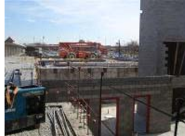
Block Work & Steel -- Gym