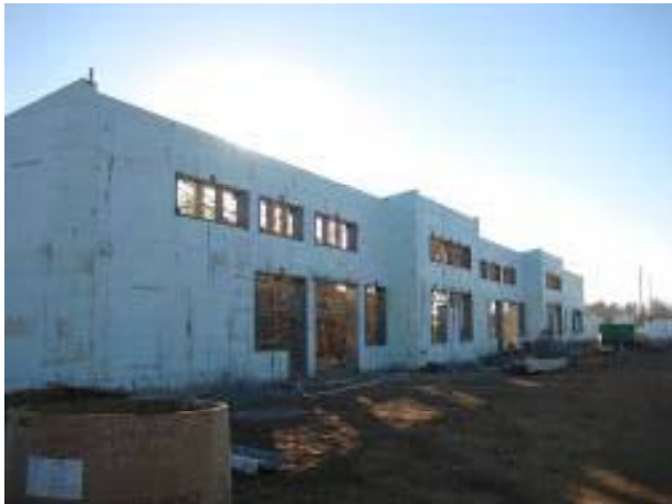
Academic Bldg. North Elevation