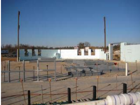
Academic Bldg. Looking North