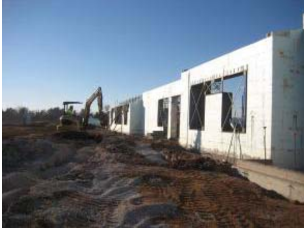
Academic Bldg South Elevation