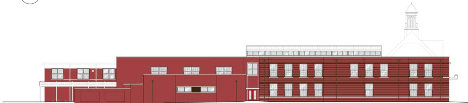
TATES CREEK ROAD ELEVATION SCALE: 1/8" = 1'-0"

BUILDING ELEVATIONS FAYETTE COUNTY PUBLIC SCHOOLS M. A. Cassidy Elementary School 1125 Tates Creek Road Lexington, KY 40502