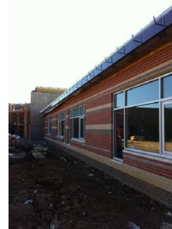
Windows & Gutter Hangers