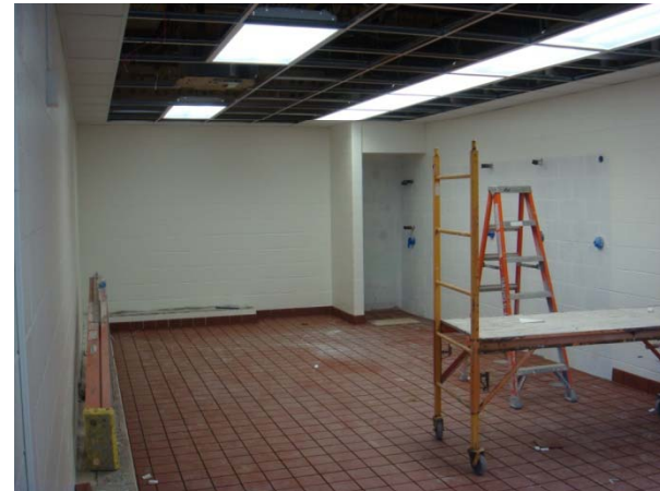
Boys Locker Room