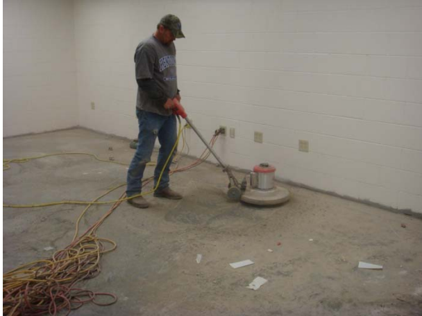
Phase 3 Floor Prep