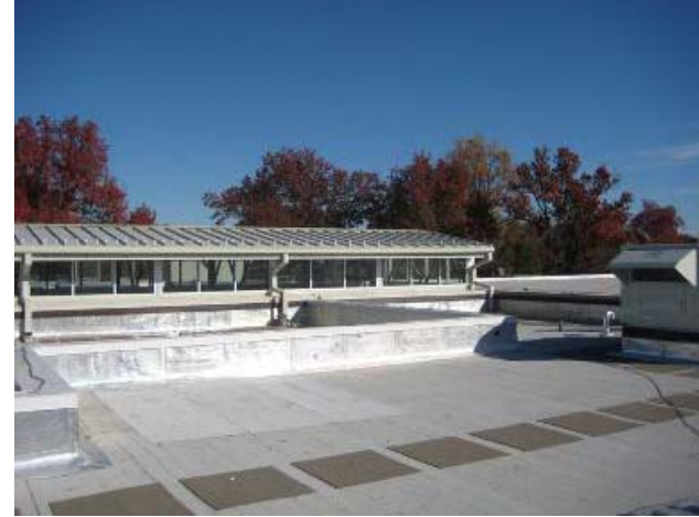
Media Ctr. Atrium Roof