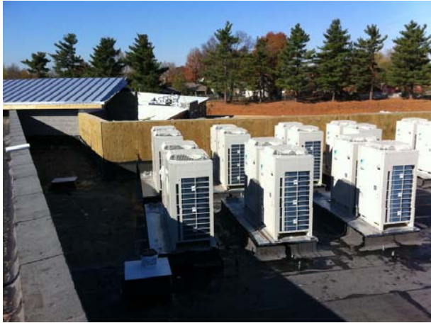
Mechanical Units on Admin. Roof