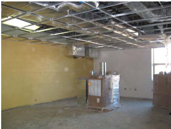
Ceiling Grid & Light Fixtures