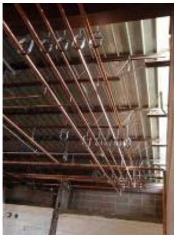
MEP Rough in