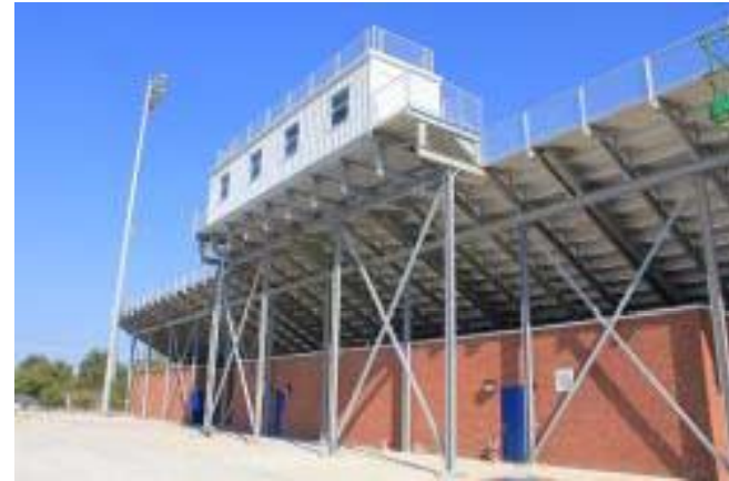
Back Side of Home Grandstand