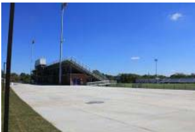
Plaza & Home Grandstand