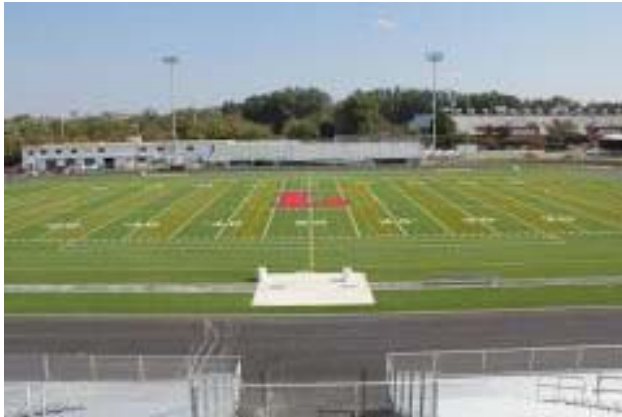
Field from Home Grandstand