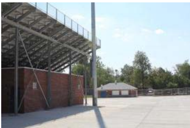
Concession & Restroom Buildings