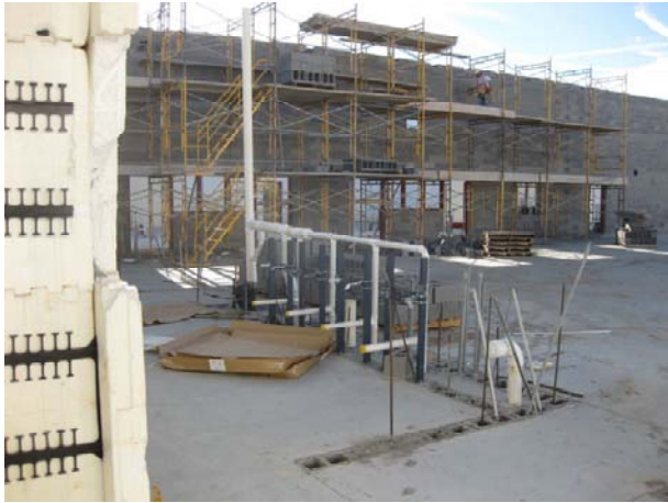
CMU Walls in Cafeteria