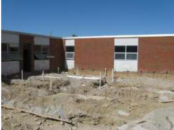
Plumbing Rough-in -- Courtyard