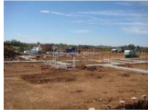
Classroom Bldg. Site – Footings & MEP