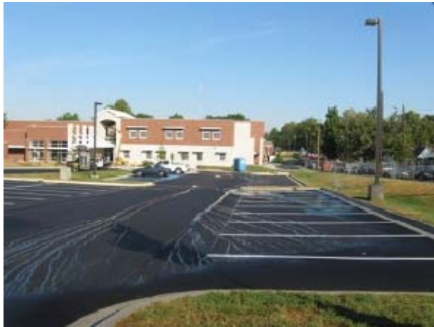
Parent Drop Off & Parking