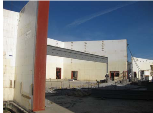
ICF Walls in Gym