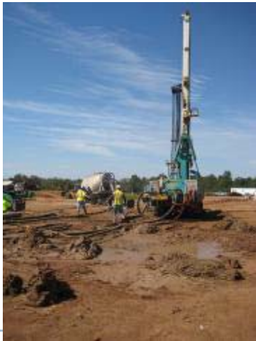
Compaction Grouting – Arena Area