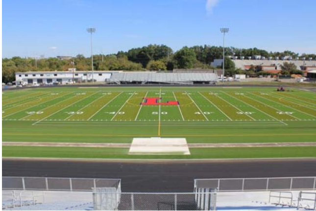
Field from Home Side Grandstands