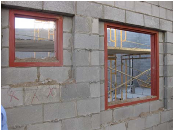
Main Corridor Windows