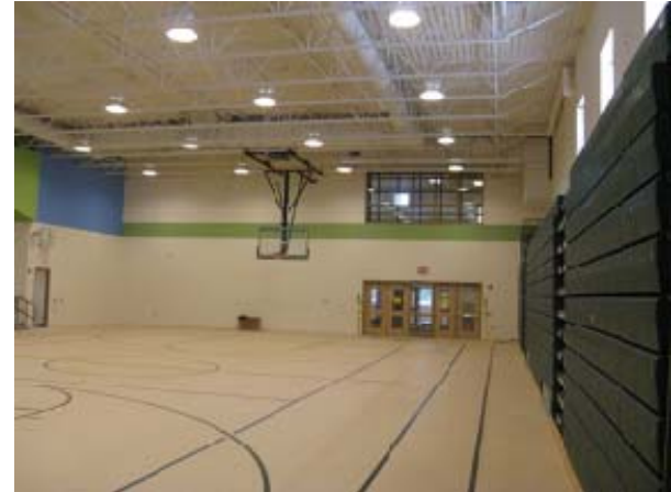
Gym w/ Bleachers