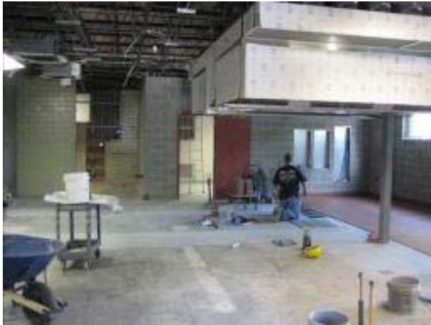
Kitchen Renovation w/ New Hood