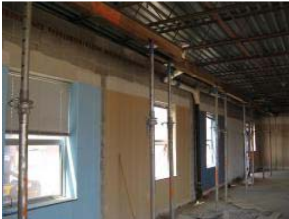
Shoring for Existing Structural Joists