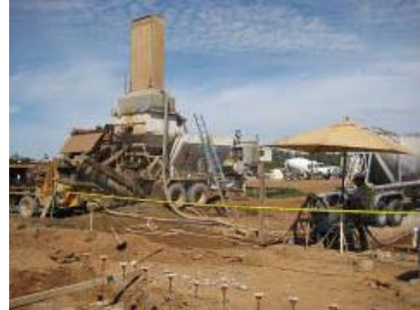
Compaction Grouting – Mixing Assembly