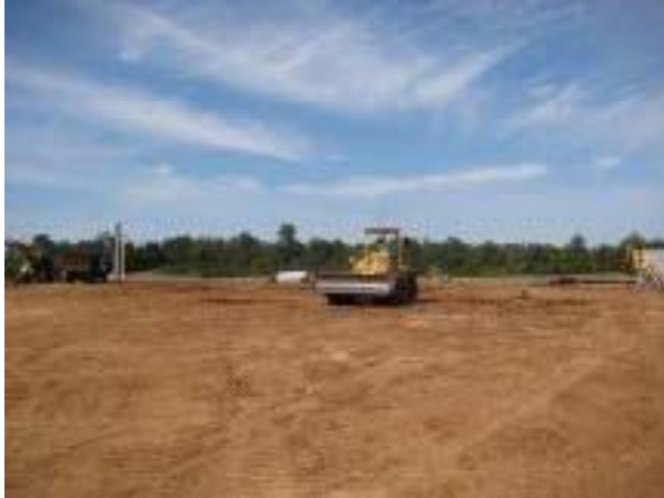
Classroom Bldg. Site – Proof Rolling