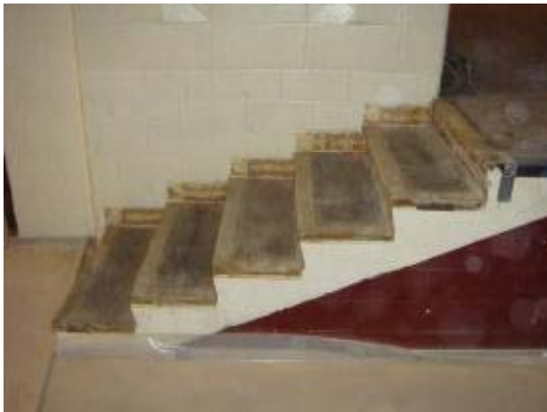
Stage Floor Finish Demo