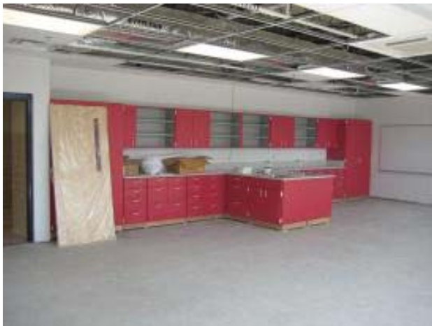
Nature Studies Classroom w/ Casework