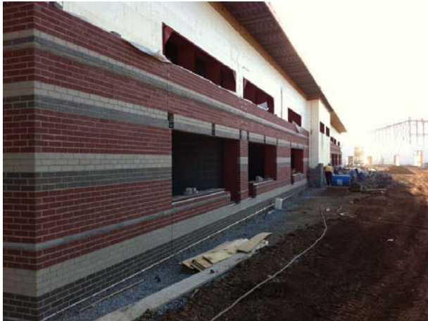
West Wing Masonry Installed