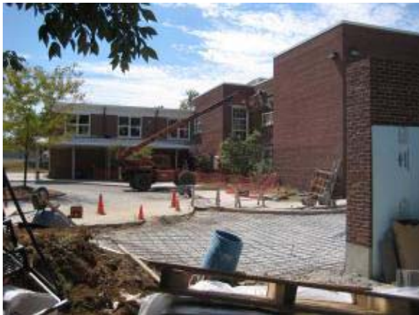
Cassidy Ave. Entrance w/ New Canopy