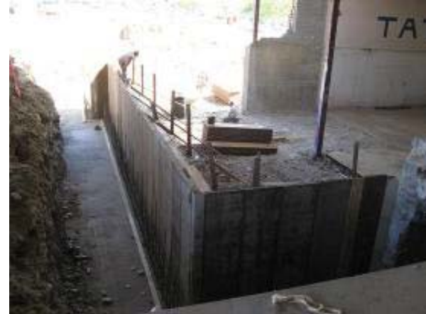
Lower Level Concrete Wall Form-up