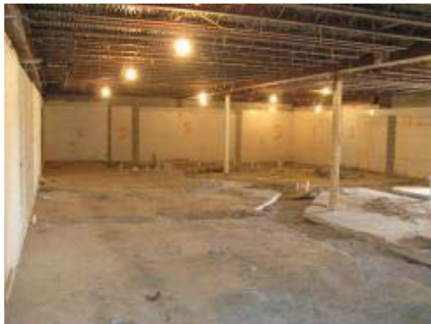
Locker Room Plumbing Rough-in