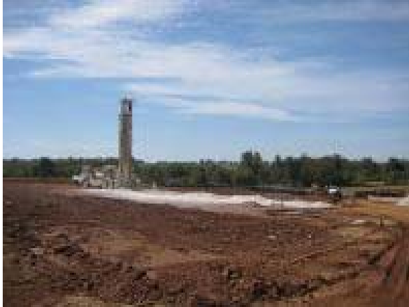
Geothermal Well Drilling