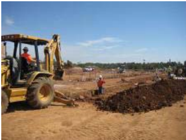
Classroom Bldg. Site -- Trenching