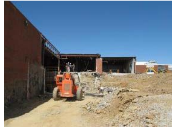
Lower Level Foundation Work