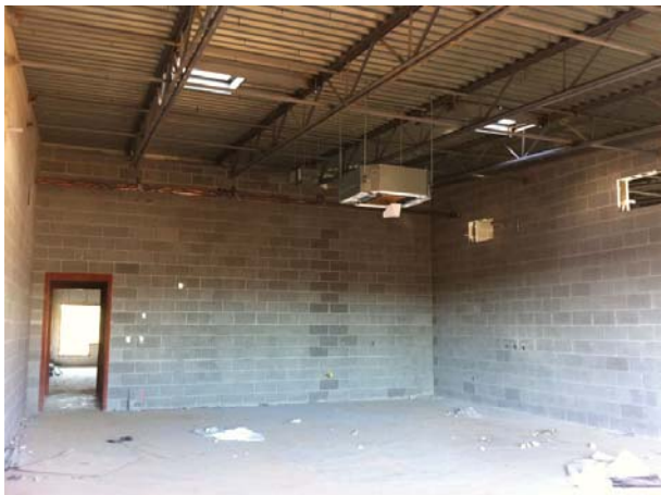
Daiken Units in Classroom