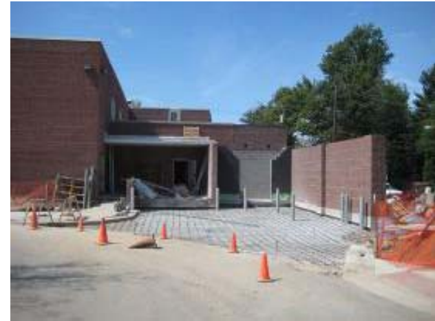
Loading Dock Renovation