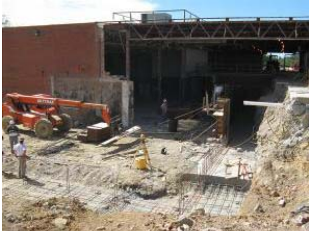
Area Foundation Work & Demo