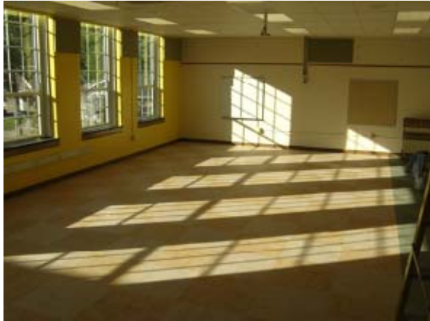
Renovated Music Classroom