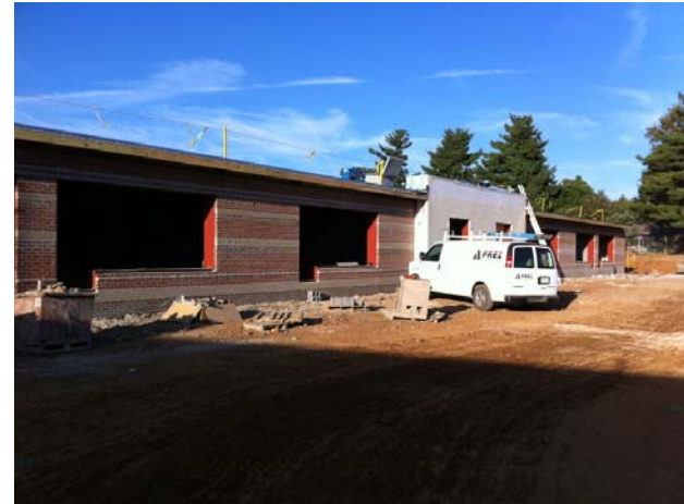
West Wing Masonry