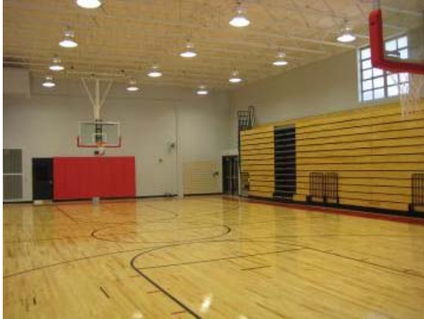
Gym -- New Floor & Bleachers