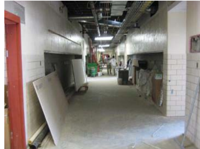
First Floor Corridor