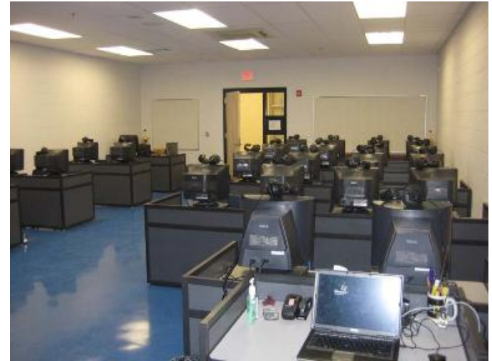
New Computer Lab