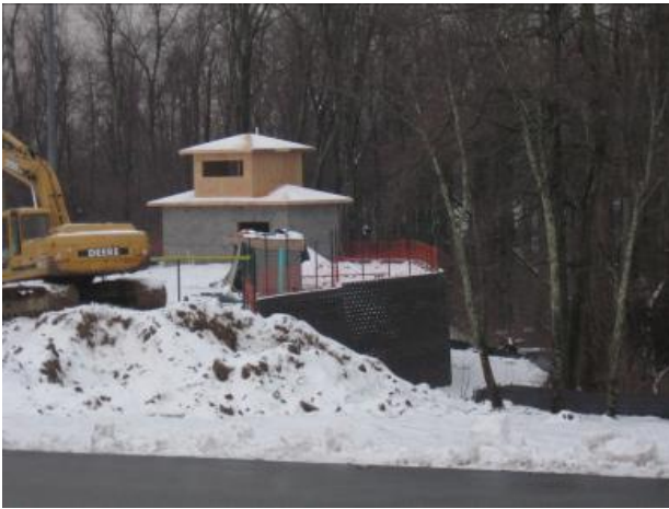
New Press Box, Dugout & Retaining Wall