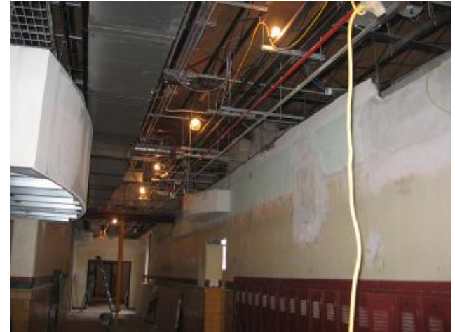
New Metal Framing – 1 st Fl.