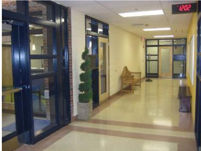
New Entry Corridor