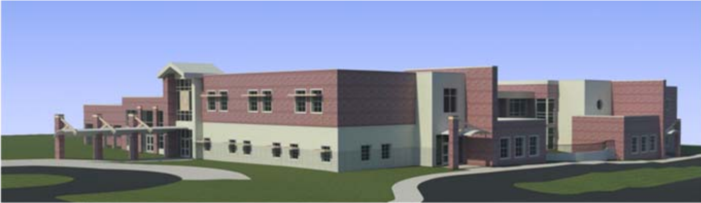
Rendering of Final Façade