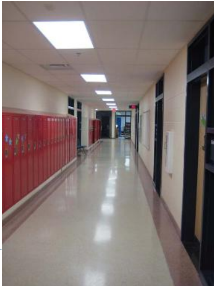
New Classroom Corridor