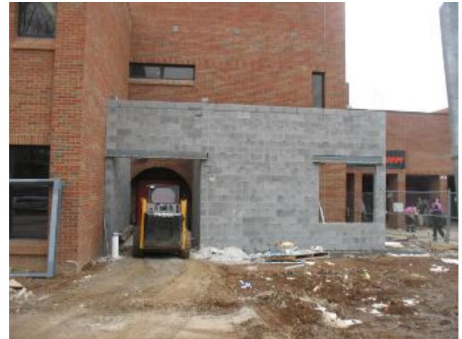
Terrazzo in New Lobby