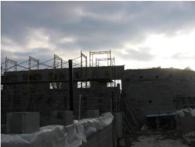
Floor Slabs Complete