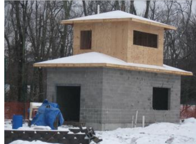
New Press Box