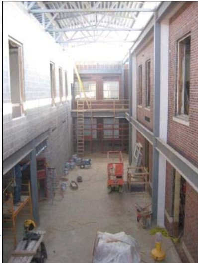
New Media Center from 2 nd Fl.