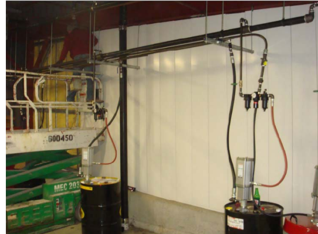
New Fluid Storage Addition