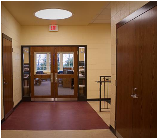
Entry into New Media Center