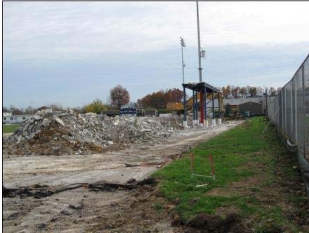
Demo of Home Grandstand