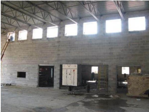
New Kitchen & Cafeteria